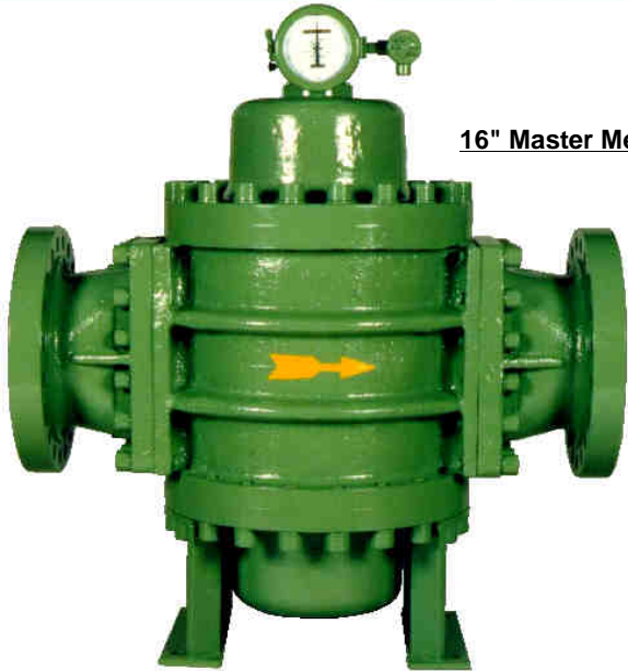
16" Master Meter